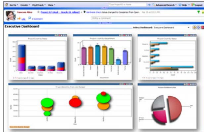
Figure 1. Dashboards aggregate and present key metrics in an intuitive fashion.