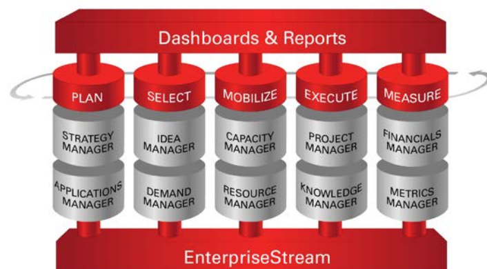
Figure 2. Instantis EnterpriseTrack provides a modular solution approach.

The EnterpriseStream module of Instantis EnterpriseTrack is the first and only purpose-built and seamless collaboration and social networking capability for PPM practitioners and stakeholders across the enterprise. As a result, there is virtually zero effort to set it up, access the tool, start collaborating, and realize immediate productivity results.