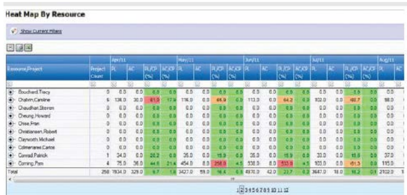
Figure 1. Gain instant visibility to availability by resource or role with heat map reports.

The following screen shots highlight key resource and capacity management capabilities including resource availability/utilization heat maps, what-if scenario planning, and graphical resource utilization reporting.