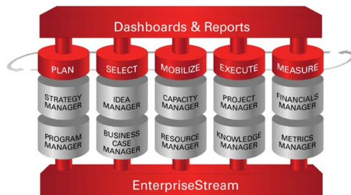
Figure 2. EnterpriseTrack provides a modular solution approach

The EnterpriseStream module of Instantis EnterpriseTrack is the first and only purpose-built and seamless collaboration and social networking capability for PPM practitioners and product delivery stakeholders across the enterprise. As a result, there is virtually zero effort to set it up, access the tool, start collaborating and realize immediate productivity results.